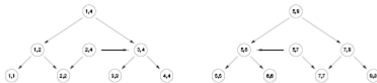
Fig. 3. The 2^3 -RQP graph

Let us show an example, the 8-RQP graph in Figure 2 is the result of cloning the 2^2 -RQP graph in Figure 1. In the 8-RQP design (Z, U, R) in terms of that graph, the values of all U_i and those R_{ij} such that |R_{ij}| > 2 are: