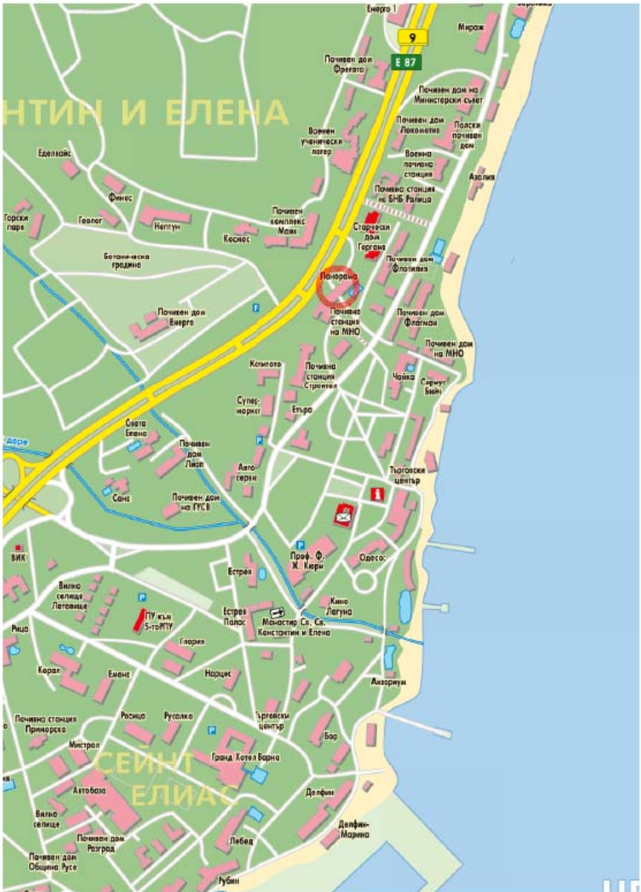
The picture is 1120m x 800m.

June 20 - July 02, 2010, Varna (Bulgaria); September-October 2010, Ukraine, Poland, Spain