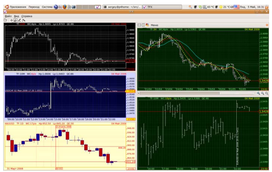
Monitoring current nature parameters on slope and allowed differences

Such computer system of decision-making support grants to expert possibility to handle easily great volumes of the information in realtime a time scale, allowing it to obtain the objective data and make the value judgment. Using effective estimations expert can easily control many parameters during time, along with allowed changes in them: