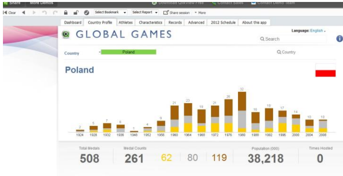
Fig.2. Application window, after choosing a particular country – Poland, which shows a number of medals won during Olympic games by Polish athletes