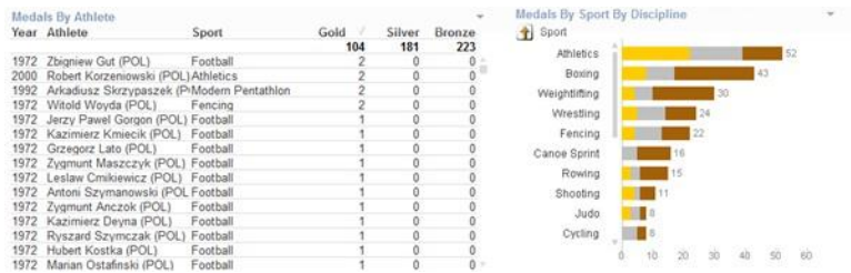
Fig.3. A list of Polish Olympians of particular sport discipline and the obtained medals as well as the number of medals won in particular sport disciplines